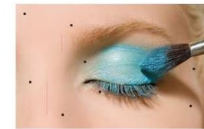
SMD LED Display (> 50PPM)