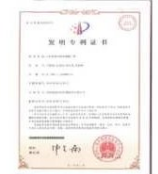
53 COB Patents