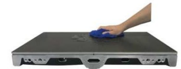
Easy to clean with water