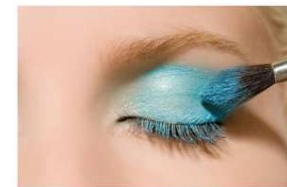
LEDMAN COB (< 10PPM)